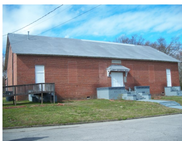
Mary E. Shaw Gymnasium

ownership has been surmounted, the club intends to breathe new life into the structure by a near total interior renovation.